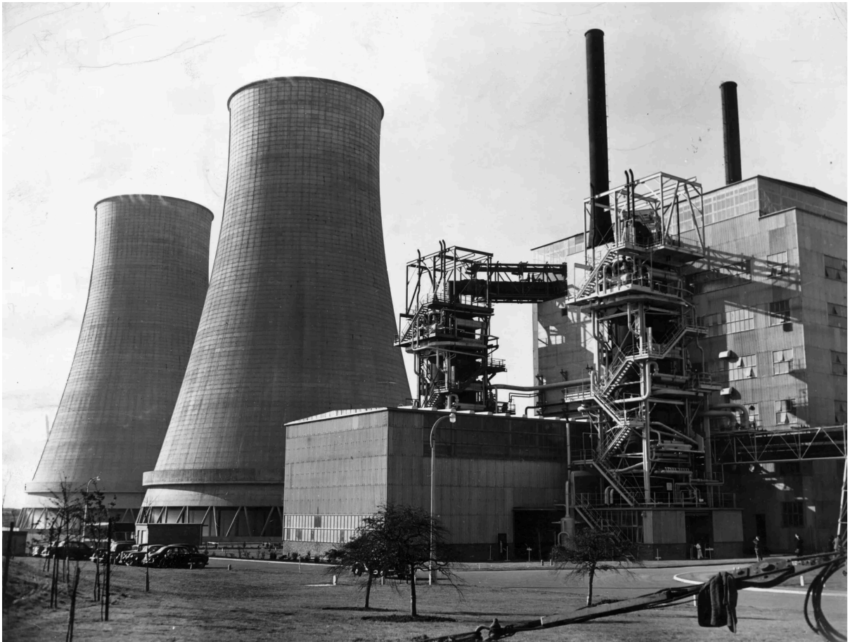
The world's first full-scale atomic power station in Britain in 1956.